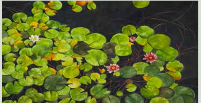
Waterlilies watercolor and drybrush on paper 28" x 40"